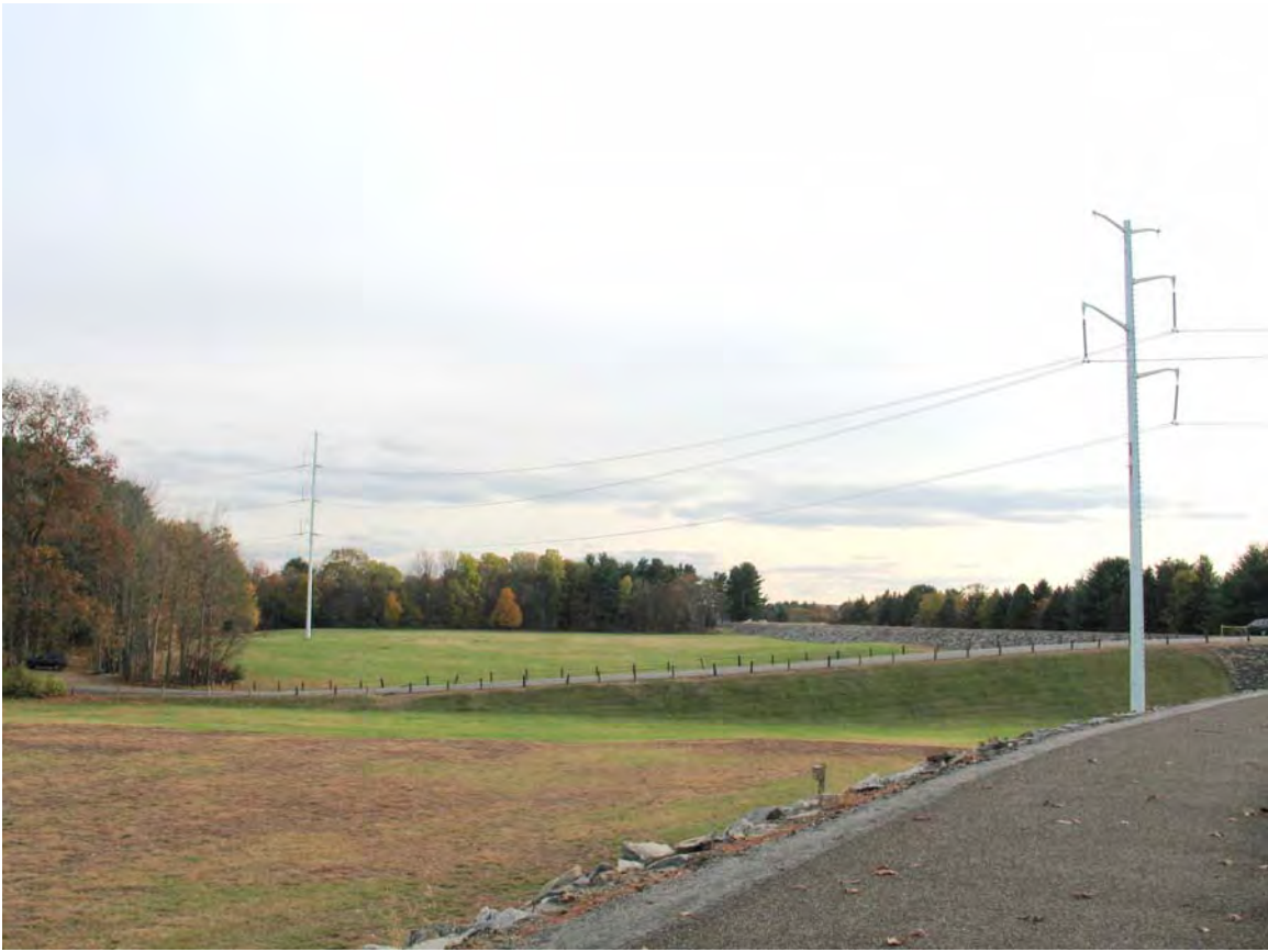
Photograph 6. VIEW SOUTHEAST FROM MANSFIELD HOLLOW DAM 430 FEET TO EXISTING STRUCTURE 9081 (RIGHT) AND 1000 FEET TO EXISTING STRUCTURE 9082 (LEFT)