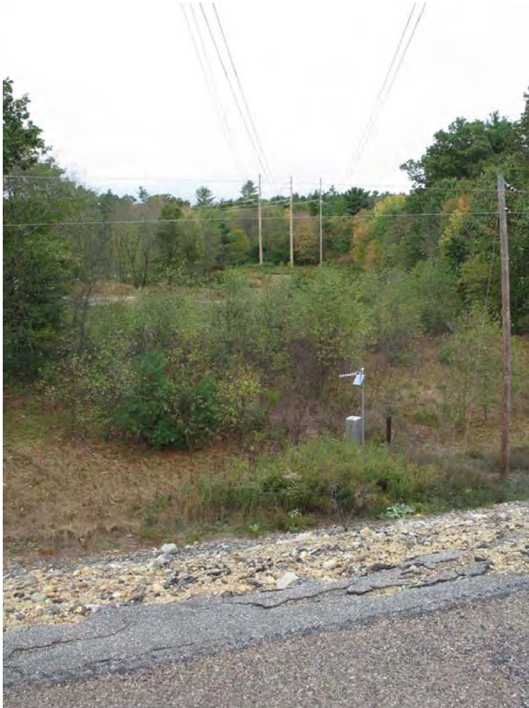
Photograph 4. VIEW NORTHWEST FROM MANSFIELD HOLLOW DAM DAM 630 FEET TO EXISTING STRUCTURE 9080