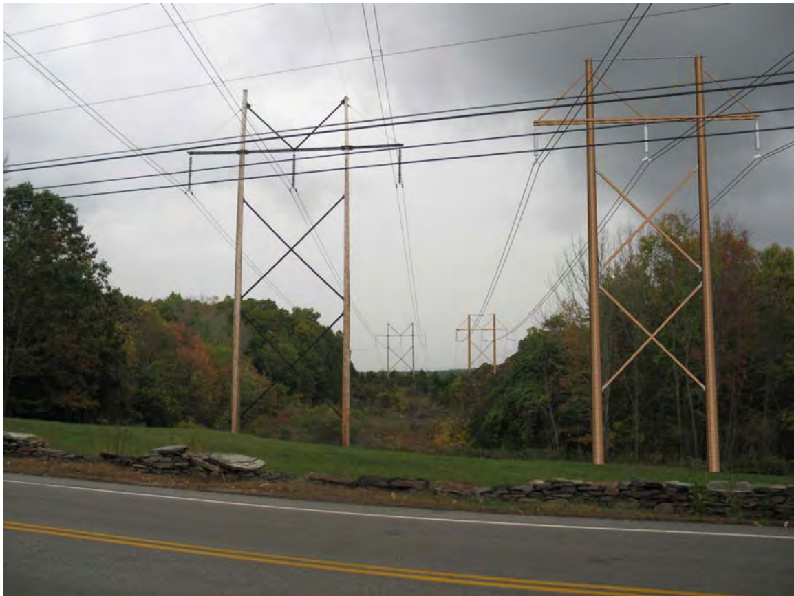
Photograph 11. VIEW NORTHEAST FROM STATE ROUTE 169 WITH EXISTING & SIMULATED STRUCTURES