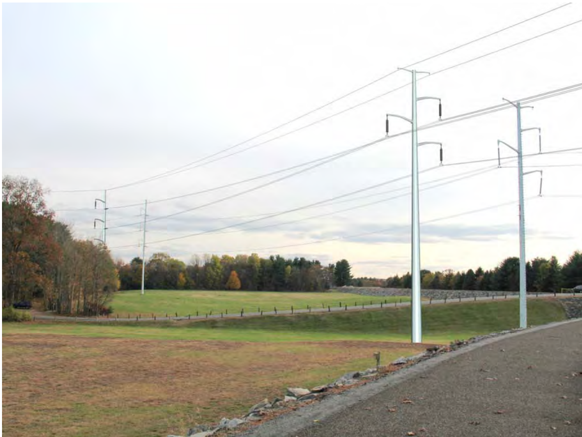
Photograph 7. VIEW SOUTHEAST FROM MANSFIELD HOLLOW DAM WITH EXISTING AND SIMULATED STRUCTURES