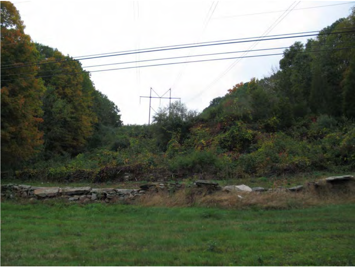
Photograph 8. VIEW SOUTHWEST FROM STATE ROUTE 169 400 FEET TO EXISTING STRUCTURE 9198