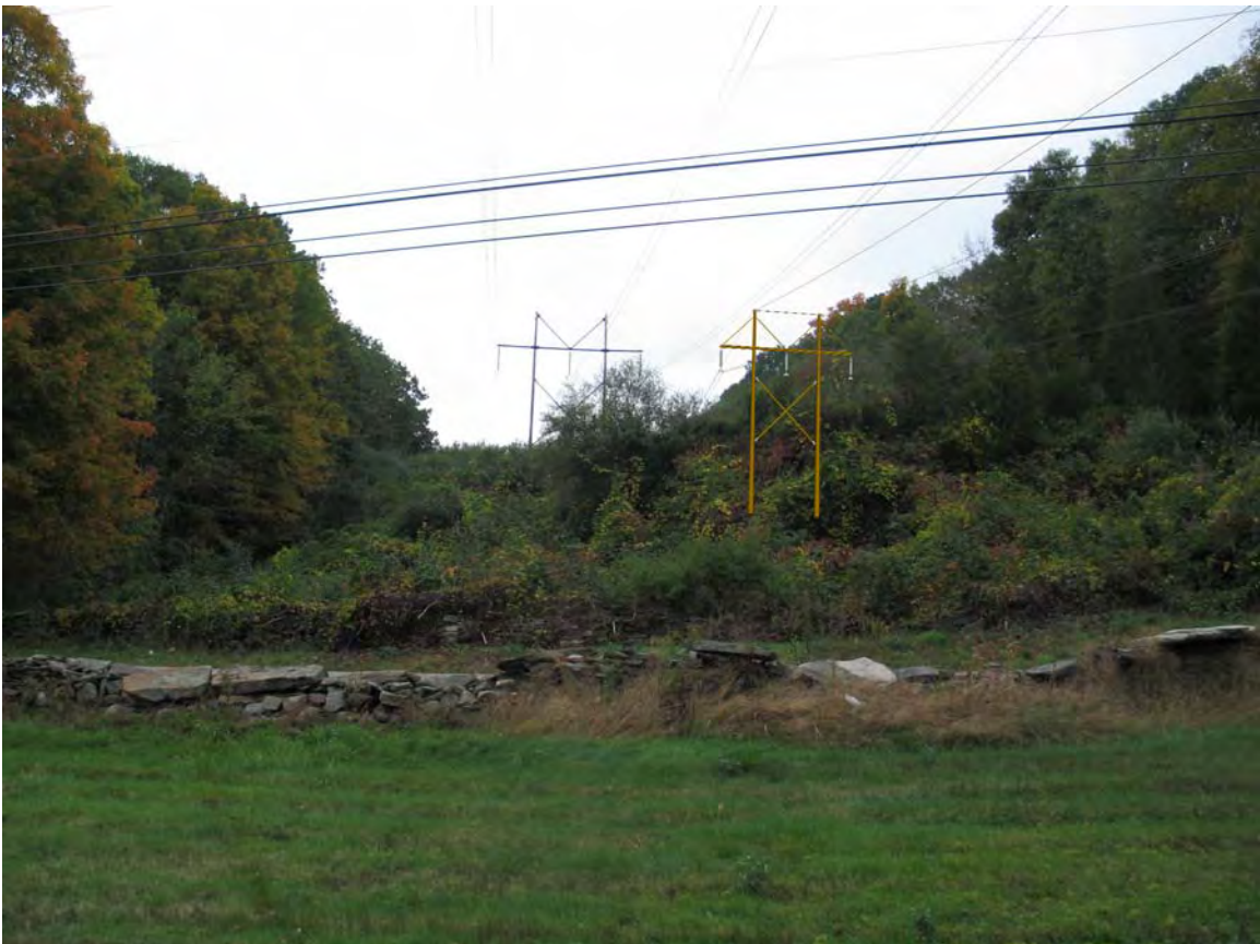
Photograph 9. VIEW SOUTHWEST FROM STATE ROUTE 169 TO EXISTING AND SIMULATED STRUCTURE