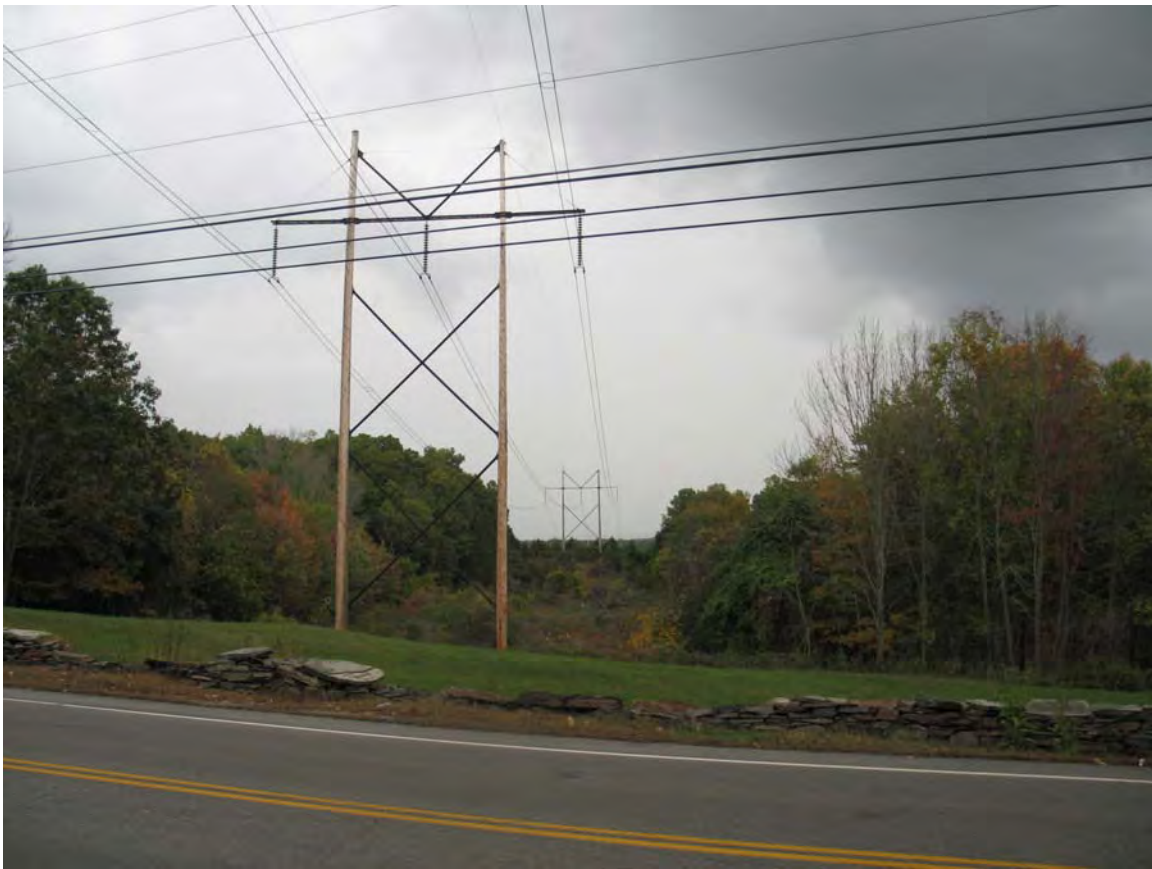
Photograph 10. VIEW NORTHEAST FROM STATE ROUTE 169 130 FEET TO EXISTING STRUCTURE 9199