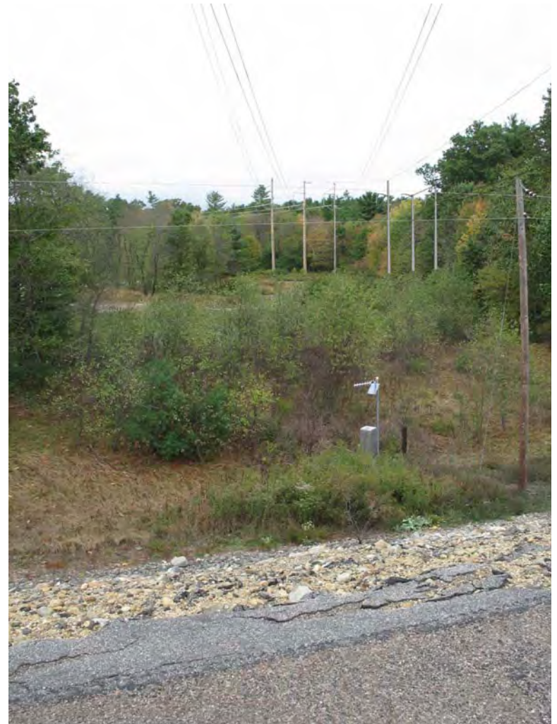
Photograph 5. VIEW NORTHWEST FROM MANSFIELD HOLLOW DAM WITH EXISTING AND SIMULATED STRUCTURES