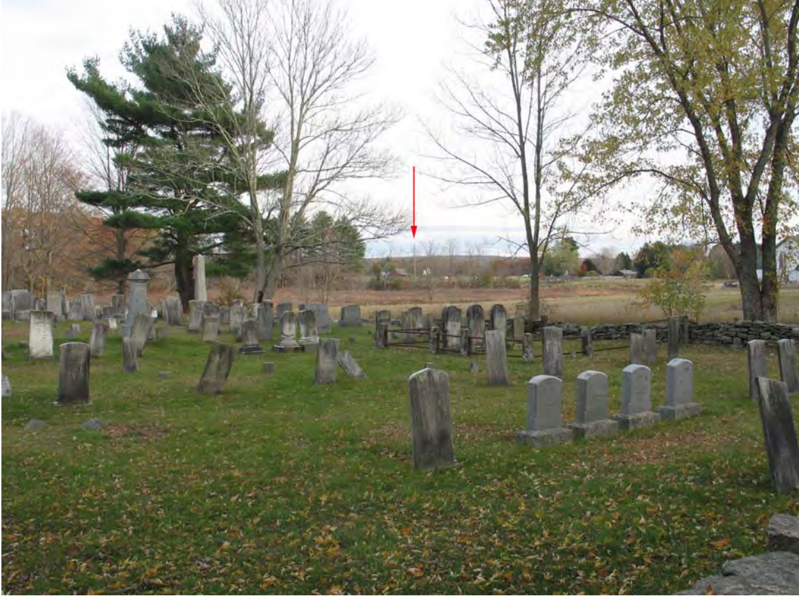
Photograph 1. VIEW SOUTHEAST FROM MANSFIELD CENTER CEMETERY 1900 FEET TO EXISTING STRUCTURE 9076

Existing 60-foot-high wooden H-frame structure, located just south of Bassett Bridge Road, is barely visible. A similar new structure, even if 90 feet high, would not have an adverse visual effect.