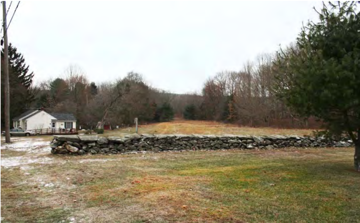
Photograph 2. VIEW WEST FROM WESTERNMOST HOUSE IN MANSFIELD HOLLOW HISTORIC DISTRICT APPROXIMATELY 800 FEET TO MOUNT HOPE MONTESSORI SCHOOL OVERHEAD VARIATION ALIGNMENT