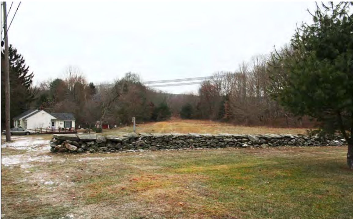
Photograph 3. VIEW WEST FROM WESTERNMOST HOUSE IN MANSFIELD HOLLOW HISTORIC DISTRICT WITH SIMULATED MOUNT HOPE MONTESSORI SCHOOL OVERHEAD VARIATION STRUCTURE AND CONDUCTORS